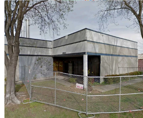
East Bay Crematory 9850 Kitty Ln, Oakland, CA 94603

Nearby landmarks: Airport parking lots & Waste Management 98th Ave. corporate office